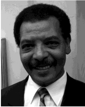
Kifle Mulat © AI Ethiopian Free Press Journalists Association

Ethiopia has a well-developed human rights community. However, it faces hostility from the government and ruling party where HRDs have criticised or exposed human rights abuses by government. Ethiopian HRDs have developed internal and external networks despite the political pressures and a situation of massive human rights violations in many parts of the country.