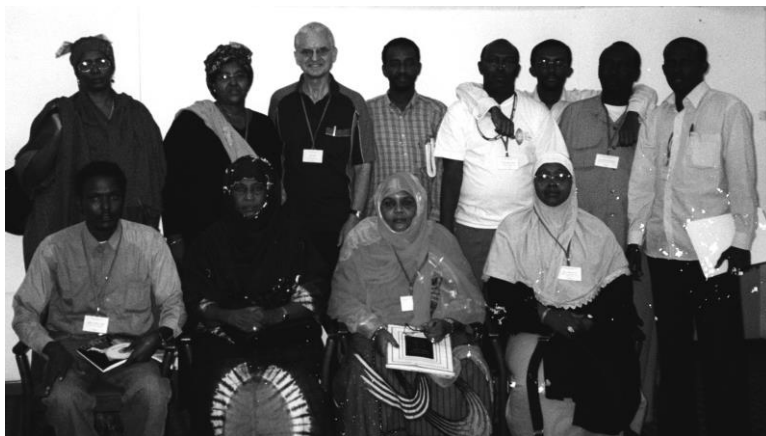
Somalia Human Rights Defenders and AI researcher